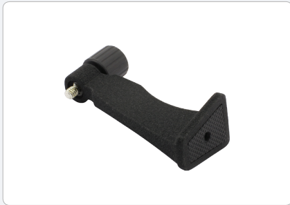
ATA - Tripod Adapter