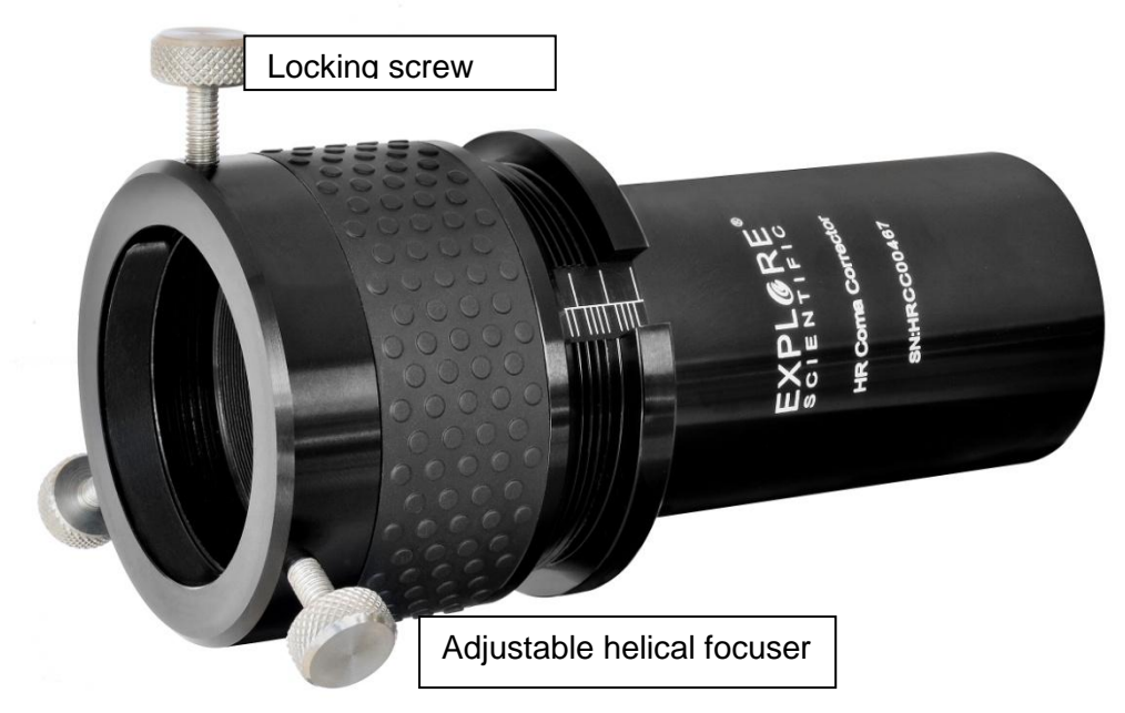
Figure 1: Front view

Congratulations on the purchase of the Explore Scientific HR Coma Correctors. You can use the HR Coma Corrector visually and photographically. When you receive the HR Coma Corrector, it is assembled for visual work. Two big parts are connected for this purpose – the base unit that includes the optical system of the HR Coma Corrector and the attached helical focuser. A small radial Allen screw secures the helical focuser. This Allen screw can be removed by using a 2mm Allen key (not part of the delivery).