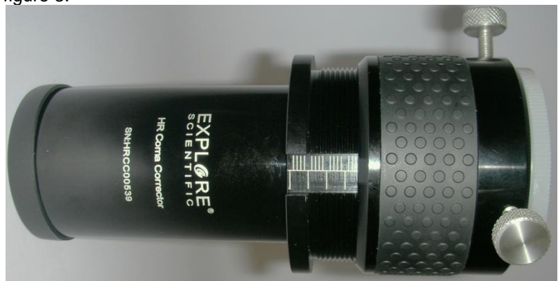
Figure 3 Zero Position

Let us configure the HR Coma Corrector first. At the side of the HR Coma Corrector you will notice a grove that contains a laser-etched scale. It shows you marks in 1mm divisions – 4 to one side and the 5<sup>th</sup> to the other side for better overview. Screw the top end of the helical focuser out, until the rim of the movable part is 13,5mm above the lower end of the helical, as shown in figure 3.