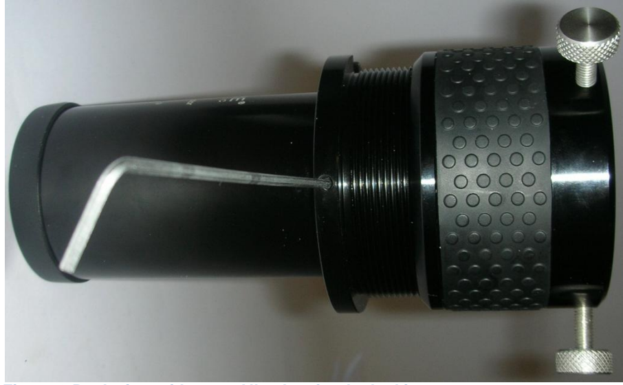
Figure 2:Back view with 2mm Allen key for the locking screw