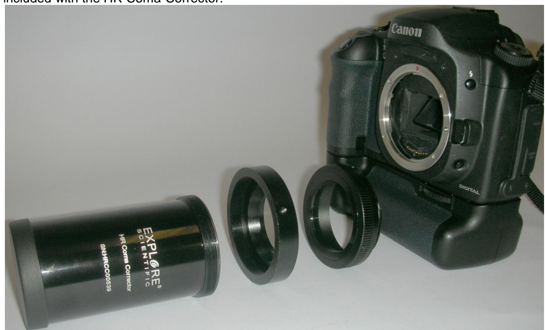
Figure 5: HR Coma Corrector with T2-Adaptor, T2-Ring and camera

For Astrophotography the helical focuser of the HR Coma Correctors has to be removed. Remove the small radial Allen screw so that you are able to unscrew the helical focuser from the corrector body (See figure 2). You can attach the camera via two adaptors that come with your HR Coma Corrector: one adaptor with T2-thread, that you can use together with different camera bodies, like DSLRs. Please notice that you need an additional T2-ring for your specific camera model. This T2-ring is not included with the HR Coma-Corrector.