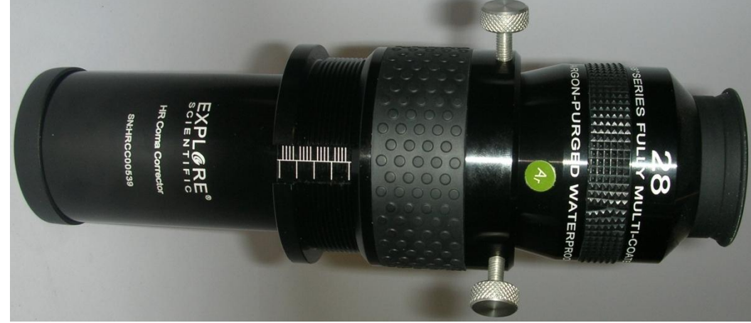
Figure 4: HR Coma Corrector with eyepiece that has a field stop 3mm below reference

Now remove the tape and insert a eyepiece into the corrector and secure it with the locking screws. Focus the eyepiece with the helical focuser by rotating the eyepiece - without touching the telescopes focuser. If you know the internal position of the field stop of your eyepiece, you can rotate directly until the correct value appears on the scale. If you – for example – know that the field stop is located 3mm below the reference surface (upper end of the eyepiece barrel), screw the helical to 13,5+3=16,5mm and then do the fine focusing.