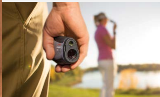
Leupold GX rangefinders are among the most compact in golf and fit comfortably in the palm of your hand.