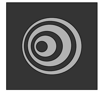
Figure 4. Star pattern of uncollimated scope.