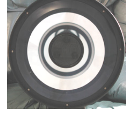
Figure 1. Mirror pattern of collimated scope.