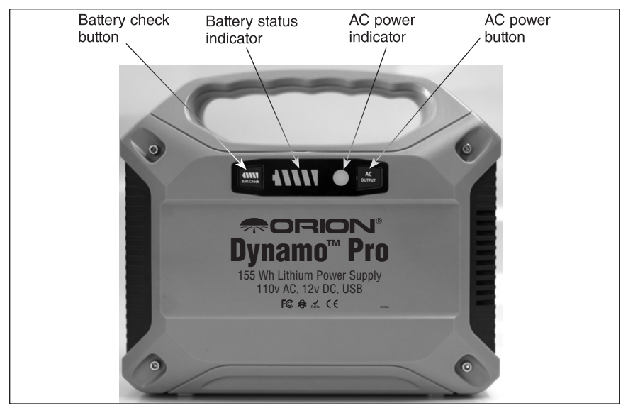
Figure 1. The Dynamo Pro 155Wh Lithium Power Supply.

The Dynamo Pro has three USB ports that can be used to power or charge USB devices such as smartphones and tablets, with a max output of 2.1A each. To use, plug the USB device into the port, and then press the "Batt Check" button ( figure 1 ) in order to send power through the port to the device. (Note this difference – the 12v output sockets are powered as soon as you plug the device in. The USB sockets are only powered after a device is plugged in AND the Battery Check button is pressed). If no device is detected on the USB ports, then the USB outputs will power down soon after in order to conserve power.