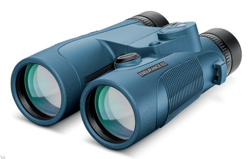
36 506 7x50 Marine Binocular with Illuminated Compass